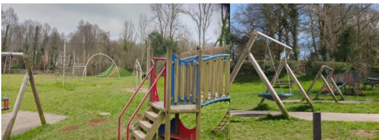
New play equipment was installed at Chillington playing field during 2012-2013 using Section 106 monies

The Stokenham Parish OSSR Plan clearly reflects evidence of need and the local community's aspirations to upgrade and provide further facilities in the vicinity.