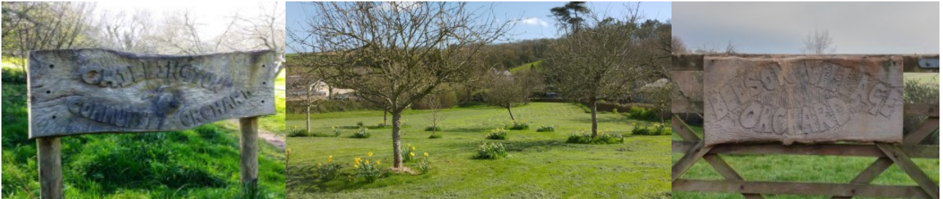
Tree planting and the promotion of community orchards form a key part of the plan

Both larger scale and local green infrastructure projects set out in the framework document are being developed and implemented by a range of organisations in partnership with local people. The Stokenham Parish OSSR Plan responses at various events confirm the importance of these initiatives to the community.